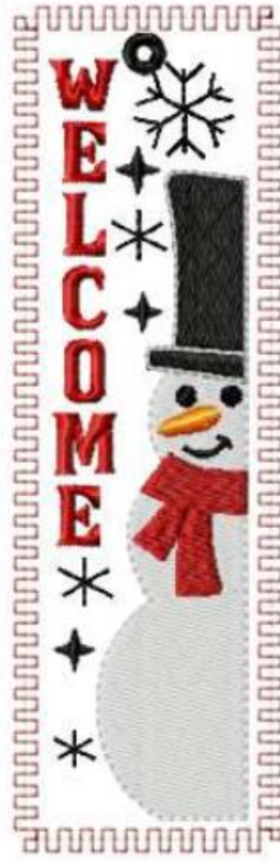
5x7DH-HolidayPorchSign-7 2.17x6.84", 9807 st, 6x10DH-HolidayPorchSign-7 3.06x9.76", 16449 st,