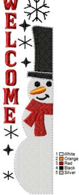
1.80x6.85 ", 11776 st, 6x10HolidayPorchSign-8 2.58x9.85 ", 19991 st,