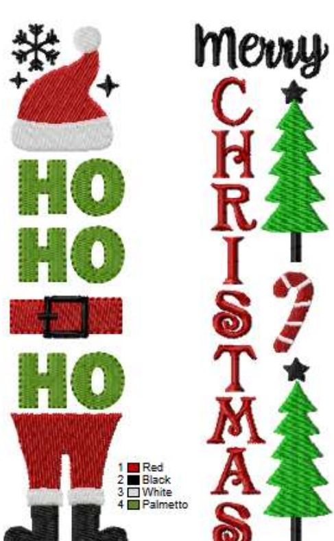
1.61x6.85 ", 11979 st,