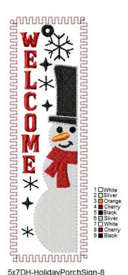
5x7DH-HolidayPorchSign-8 2.17x6.84 ", 11368 st, 6x10DH-HolidayPorchSign-8 3.09x9.85 ", 19670 st,