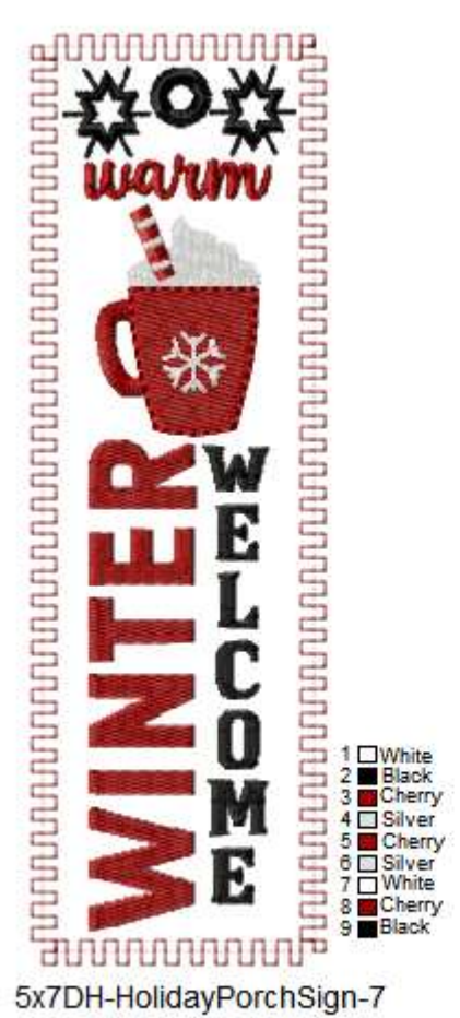
5x7DH-HolidayPorchSign-7 2.17x6.84 ", 9807 st, 6x10DH-HolidayPorchSign-7 3.06x9.76 ", 16449 st,