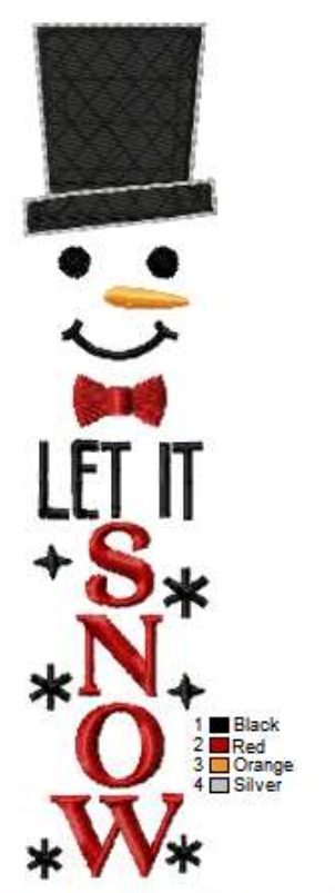
1.56x6.84 ", 6965 st, 2.23x9.85 ", 11335 st,