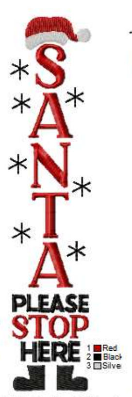
5x7HolidayPorchSign-6 1.50x6.85 ", 6204 st, 6x10HolidayPorchSign-6. 6x10HolidayPorchSign-2.16x9.84 ", 9529 st,