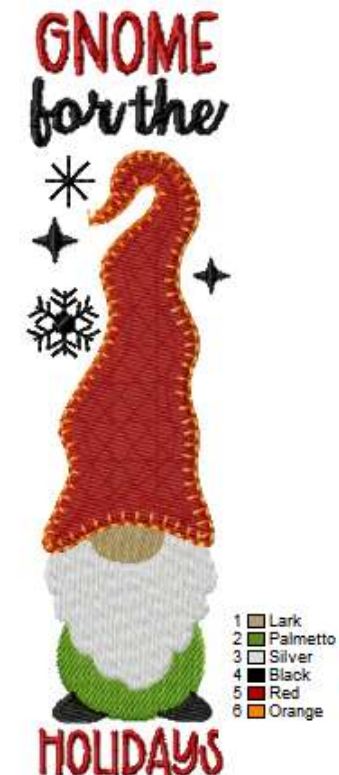
5x7HolidayPorchSign-5 1.80x6.85 ", 11691 st, 6x10HolidayPorchSign-5 2.58x9.85 ", 19637 st,

5x7HolidayPorchSign-1. 5x7HolidayPorchSign-2. 5x7HolidayPorchSign-3. 1.77x6.86 ", 7593 st. 6x10HolidayPorchSign-1 6x10HolidayPorchSign-2 6x10HolidayPorchSign-3 6x10HolidayPorchSign-4 2.30x9.85 ", 20864 st, 2.53x9.85 ", 12172 st,