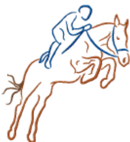
EquestrianOutlines\EQUINE TIME FOUR 6x10.pes