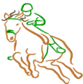
EquestrianOutlines\EQUINE TIME THREE 5x7.pes

Hoop size: 6.30x10.24 " (160.0x260.0 mm)