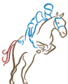
EquestrianOutlines\EQUINE TIME ONE 5X7.pes

Hoop size: 6.30x10.24 " (160.0x260.0 mm)