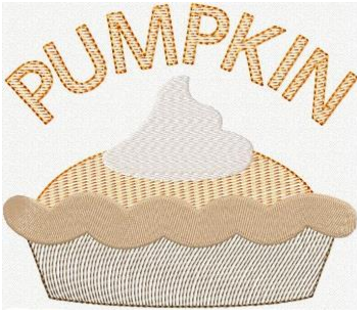
1 3 5x7FallHarvest-II-8.pes 5.72x4.90 " 2 4 (145.2x124.5 mm), 12627 st, 4/4 clrs