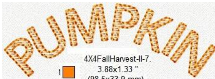
1 4X4FallHarvest-II-7. 3.88x1.33 " (98.5x33.9 mm), 2193 st, 1/1 clrs